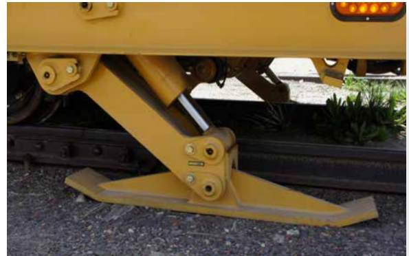
Stabilizer for RRMP 12 & 20