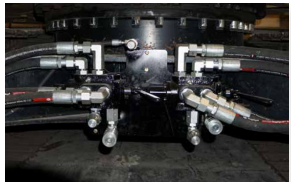
Control Valves for RRMP 12 & 20