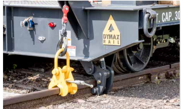
Hydraulic Clamps for RRMP 8